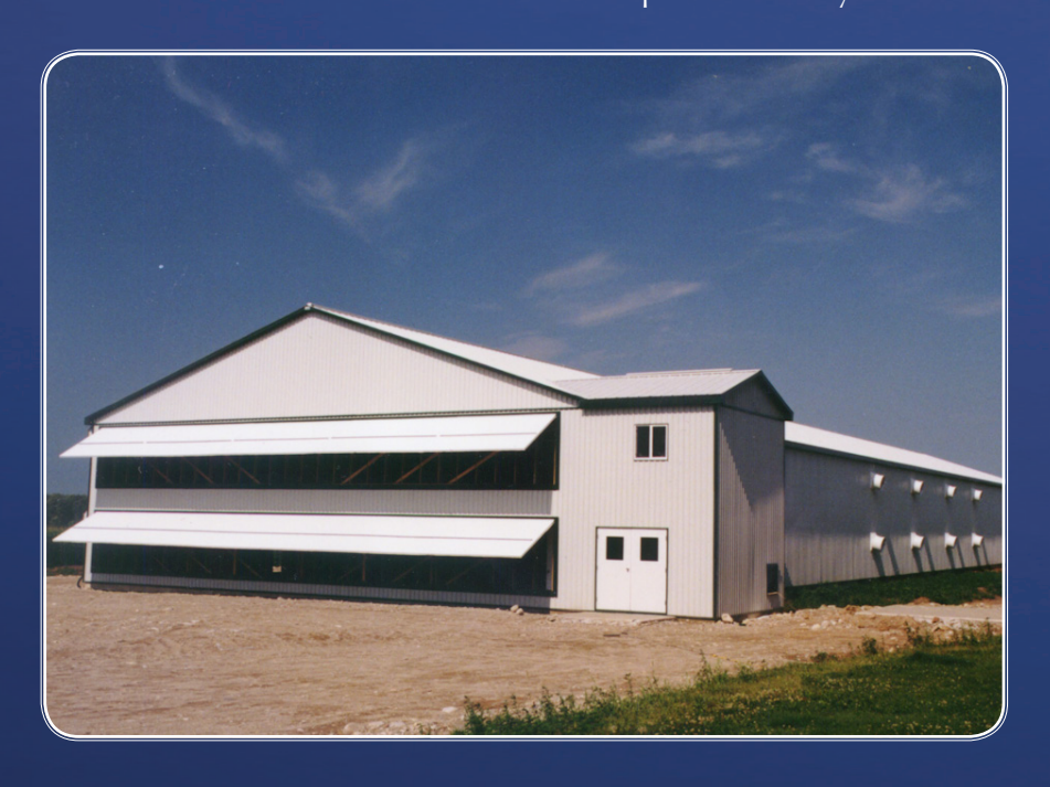
Systems Designed to Ensure You Have Optimal Ventilation!